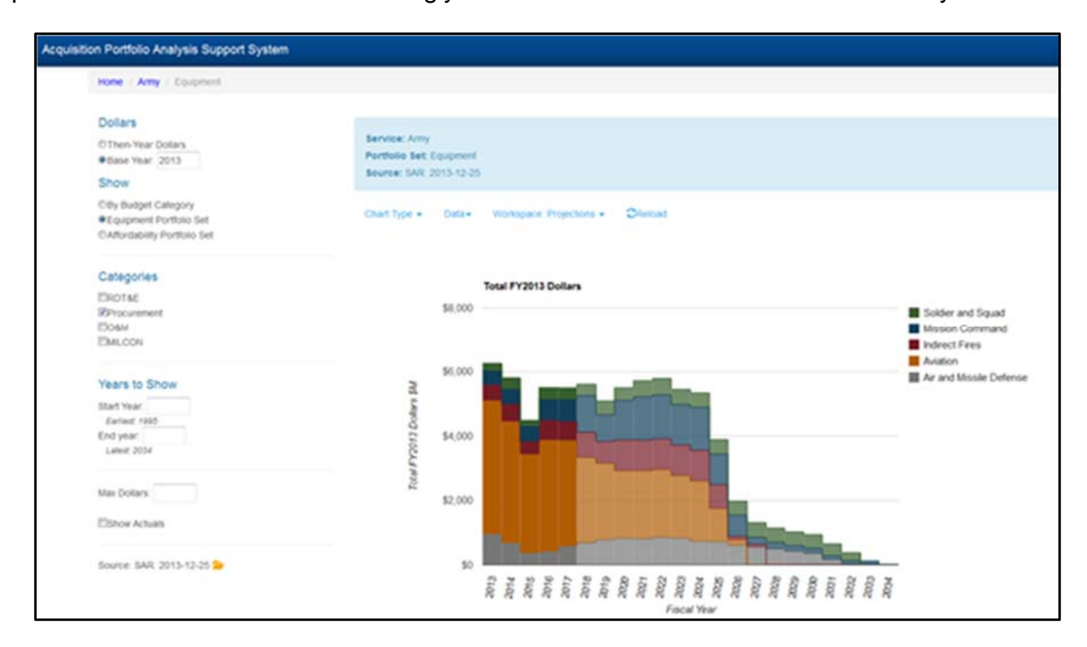
Figure 1. Army Procurement Portfolios

color. If we drill down into a single portfolio, we can see the individual program plans and the projected portfolio budget (Figure 2). The combined plans exceed the projected budget, so we invoke the "fit to budget" heuristic to extrapolate how the portfolio might adapt to the lower budget. The result is shown in Figure 3. In this example, the total procurement cost for the portfolio increases significantly. The percent increase in unit cost is not shared evenly across programs; those programs that finish quickly or that are already near their minimum production rates will not be as strongly affected as those that have more flexibility to stretch.