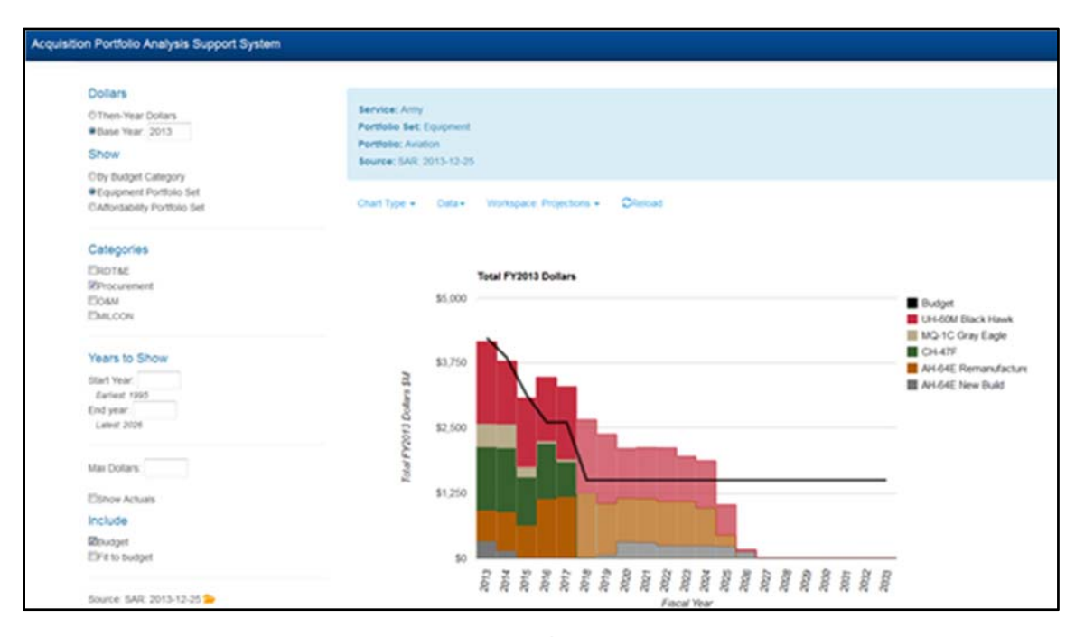
Figure 2. Portfolio With Budget