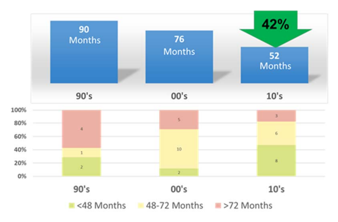
Figure 1. MDAP Development Times