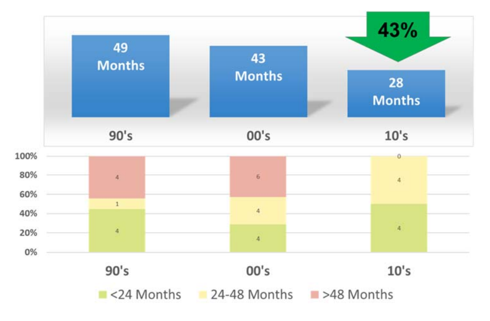
Figure 2. MAIS Development Times

Trend 2: From a cost correlation perspective, the study team observed that higher Research, Development, Test, and Evaluation (RDT&E) costs as a percentage of total Acquisition Costs correlated with shorter EMD schedule durations for both MAIS and MDAP efforts. This observation suggests that development schedules may be "bought down" with a greater share of the total acquisition budget, as depicted in Figures 3 and 4.