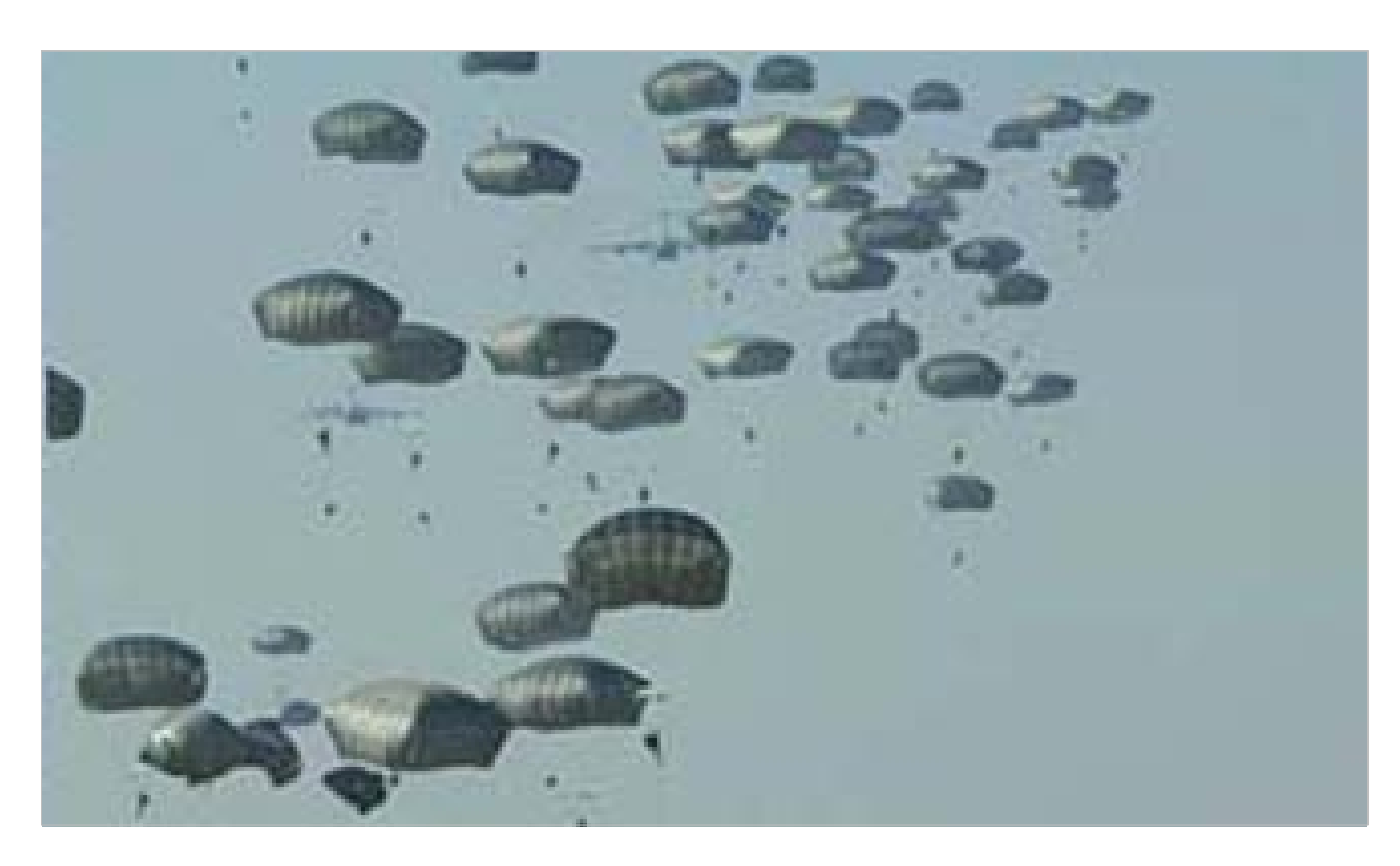
T-11 Mass Tactical airborne jump