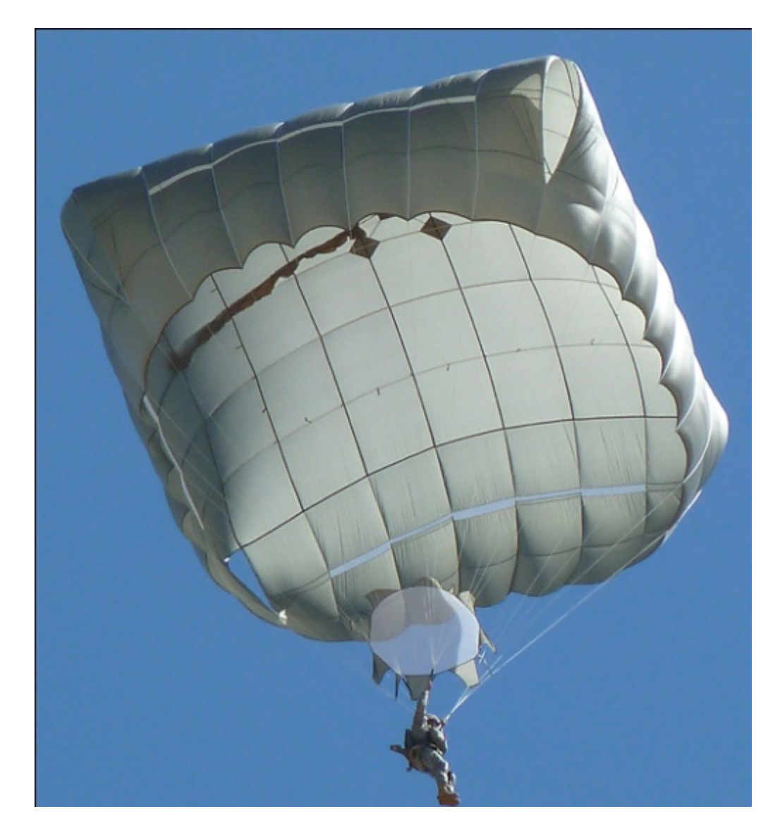
T-11 ATPS

The T-11 ATPS is a the Army's newest, most advanced, non-steerable parachute; beginning fielding in 2009 and reaching Full Operational Capability in 2014. Since its fielding in 2009, nine deaths have occurred to paratroopers using this parachute and its reserve. This report reviews the airborne community's request to assess, modify, or develop a new parachute against potential acquisition approaches for the T-11 ATPS program path forward.