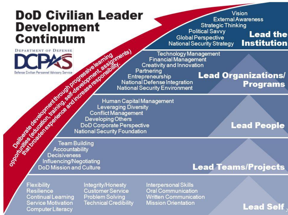
Figure 3. DoD Civilian Leader Development Continuum.

Comprehensive research was conducted using aspects of a systematic review and comparative analysis of available literature. A systematic review provides a framework for developing topics, conducting research, organizing results and setting the foundation for analysis (Jesson & Lacey, 2011). A comparative analysis takes various subjects of interest and compiles a list of similarities and differences, all within the context of the research topic (Walk, n.d.). By utilizing these two research methods, we analyzed various private sector industries within the context of leadership and managerial capabilities and compared the results to underlying problems within the DoD civilian acquisition framework.