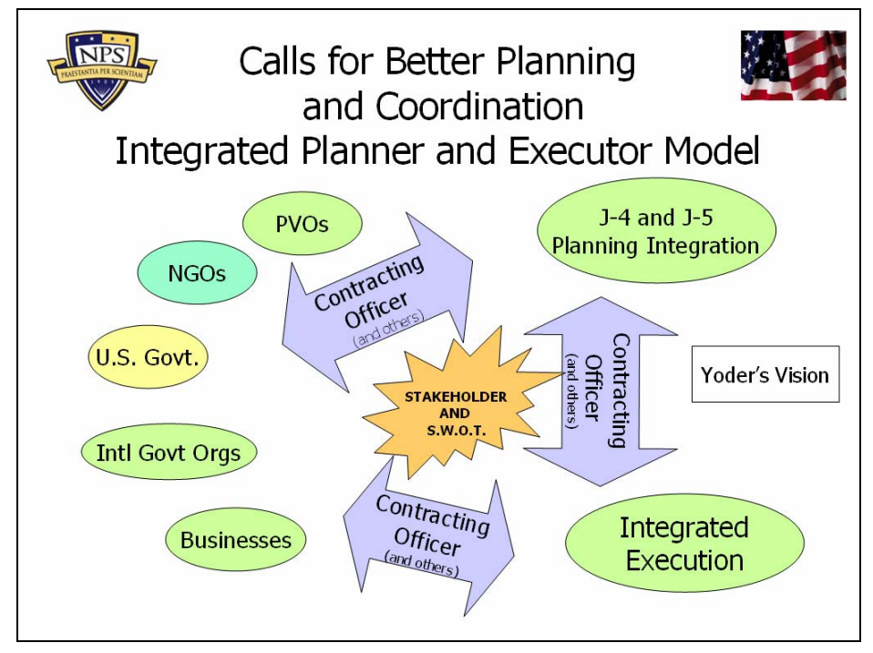
Figure 2. Integrated Planner and Executor Model

The higher-order IPE calls for the most highly-educated and seasoned planners and operational/theater-level planners. Figure 2 highlights the integrative functions among stakeholders that are a hallmark of the IPE. The Yoder Three-tier models described herein are summarized in Table 1, presented on page 17.