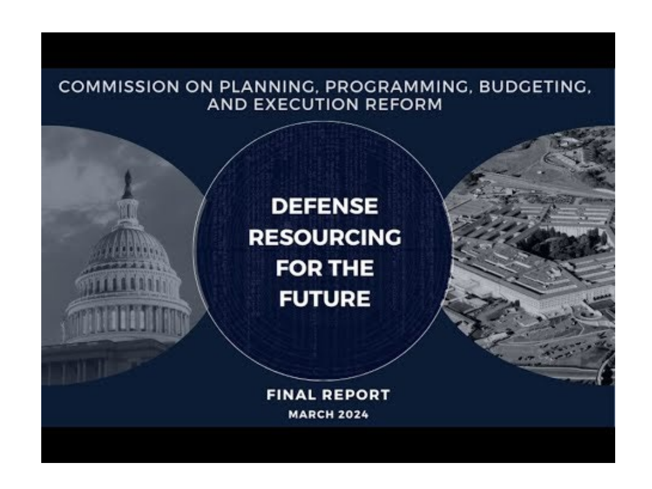
Commission on PPBE Reform (2024)